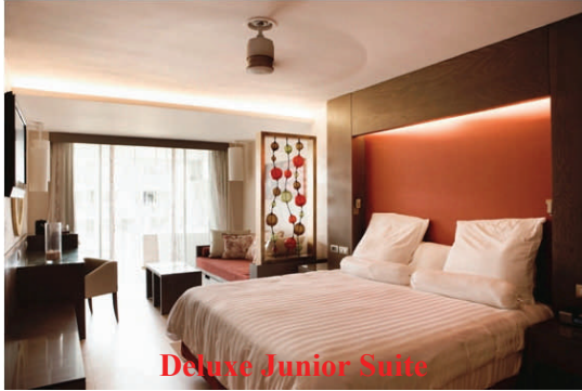
Deluxe Junior Suite

REGISTER by sending an e-mail/registration form to info@grouppalmera.com