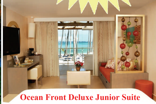
Ocean Front Deluxe Junior Suite