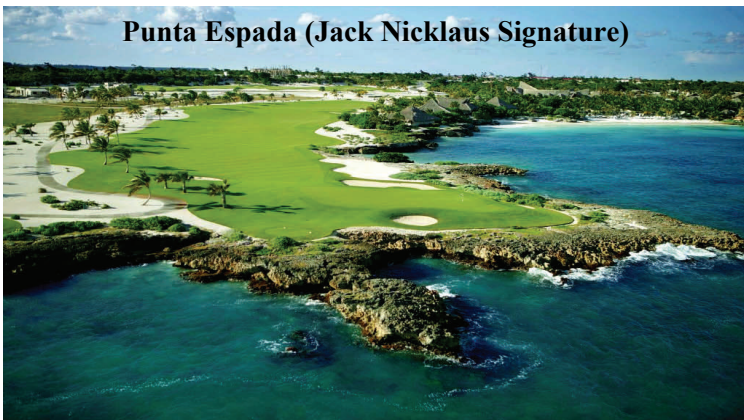
Punta Espada (Jack Nicklaus Signature)